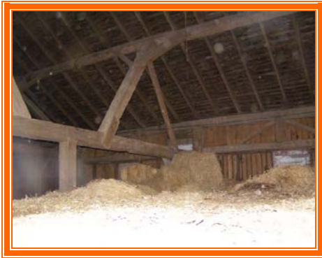
Notice the mist forming in upper right hand corner, and also on left side of pic, BEHIND the hay.