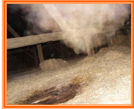
Same hayloft, but camera was held over Shannon's head.