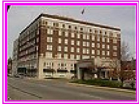
The Robert's Hotel (Muncie, IN)