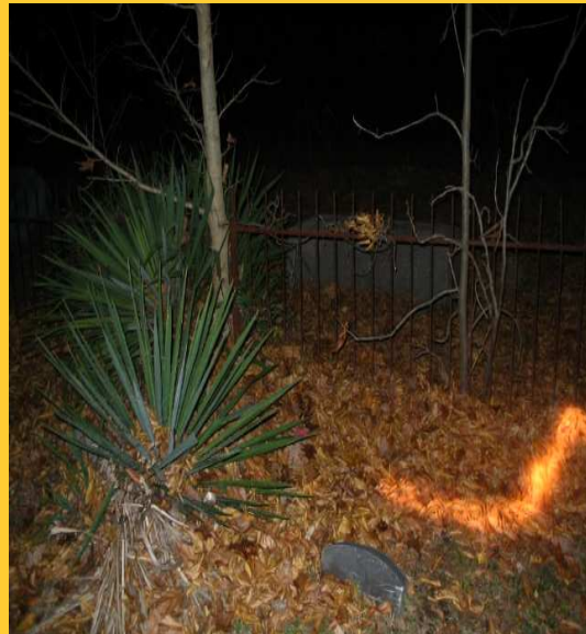
Taken out at 100 Steps Cemetery.