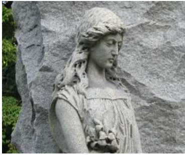
Terre Haute Indiana Ghost Trackers