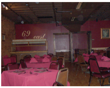
Picture Taken by Vera Schweiger-September 4<sup>th</sup>, 2005 hunt (prior to investigation).